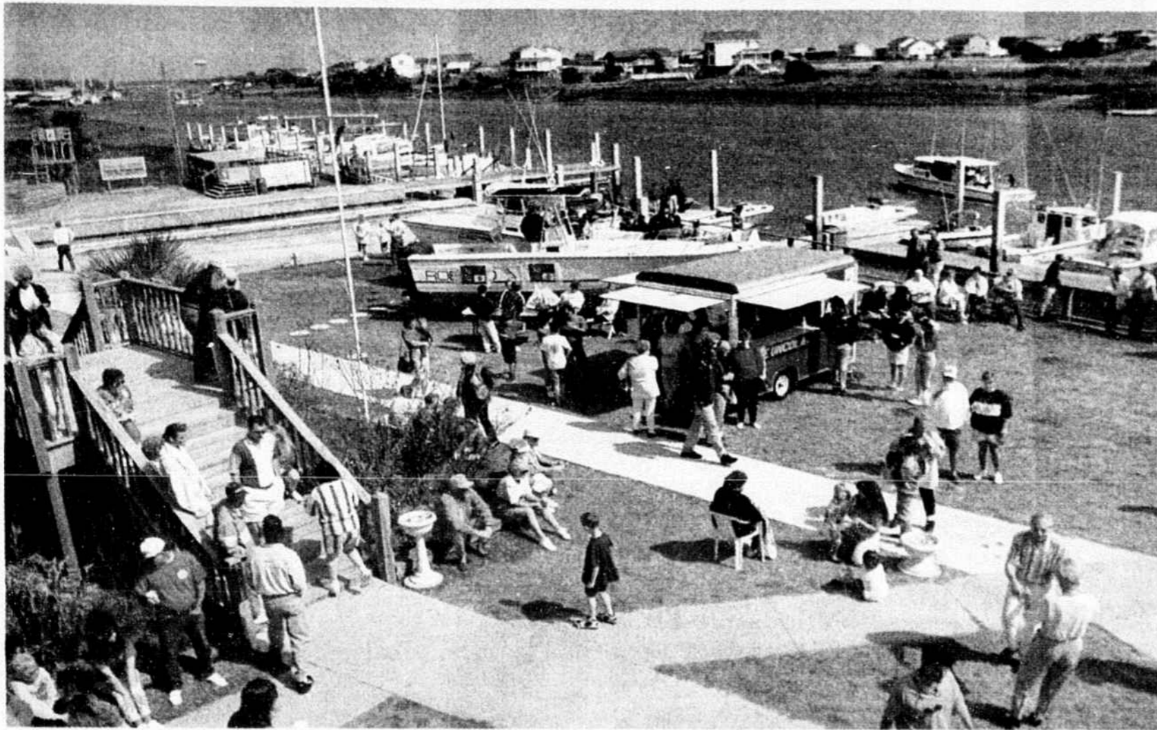
BLUE WATER AND SUNNY SKIES brings residents and visitors to the Holden Beach waterfront for boat rides, dancing, eating and enjoying each others' company.