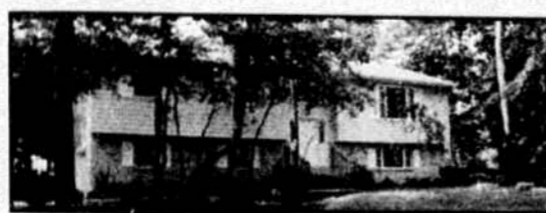
Model Home—50 Country Club Drive in Brierwood Estates Golf Club