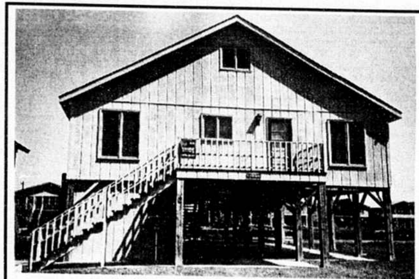
38 WILMINGTON ST. (Ocean Isle)-5-BR, 2-bath furnished home on natural canal. Just Reduced! $139,900

P.O. Box 4749, Thomasboro Road, Calabash, NC 28470 (910)579-0192 • FAX #(910)579-0814 Licensed in North & South Carolina