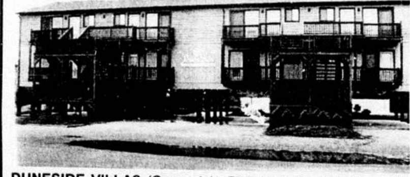
DUNESIDE VILLAS (Ocean Isle Beach)-1-BR, 1-bath condos w/pool and great views. $49,900.

QUAIL RUN ESTATES (Ocean Isle Mainland)-2-BR, 1-bath cottage close to beach and golf. $44,900.