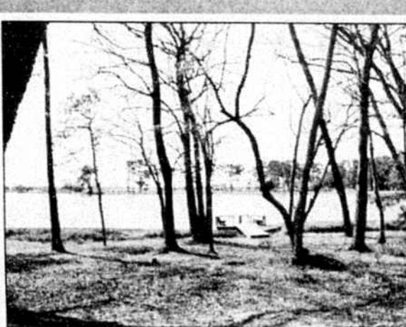
OYSTER BAY-Lake Shore Dr.. Charming lake cottage features this breathtaking view with lakefront decking and pier. 3 BR, 2 baths, open living with stone fireplace, carport, recent updates. Beautiful wooded lot.