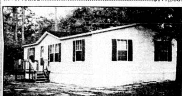
SHALLOTTE POINT-1679 Cotton Patch Rd.-New 1993 Fleetwood doublewide, 3 BR. 2 baths, vinyl siding, shingle roof, fully furnished.......$42,900.

floating dock features 3 BR, 2 baths, decking, screened porch, large living, two finished rooms on ground level. Furnished, $177,500.