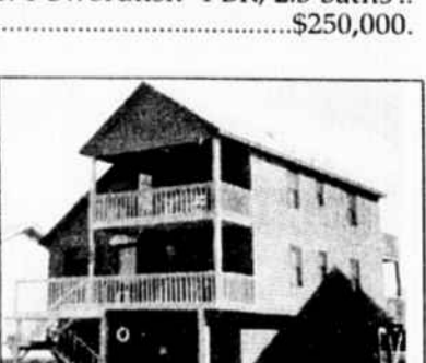
153 Brunswick Ave-4 BR, ..$144,900.