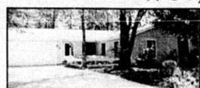
33 Swamp Fox Drive

★ JUST LISTED ★ CAROLINA SHORES GOLF COMMUNITY ★$90,999★