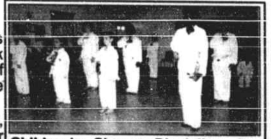
Children's Classes—Discipline, Respect, Self Confidence & Self Esteem.

The benefits are endless—Toning, Stretching, Flexibility, Stamina and a great cardiovascular workout PLUS the ability and confidence to defend yourself!