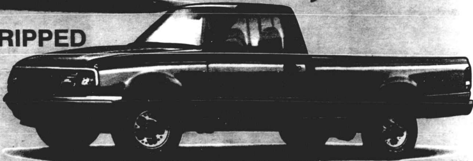
Vehicles to qualified buyers plus tax & tags. All trade ins accepted at ACV.

THE KEYS TO A BETTER, SAFER FUTURE ARE AT... Half-way between Wilmington and Myrtle Beach where you're ALL THE WAY to a better deal