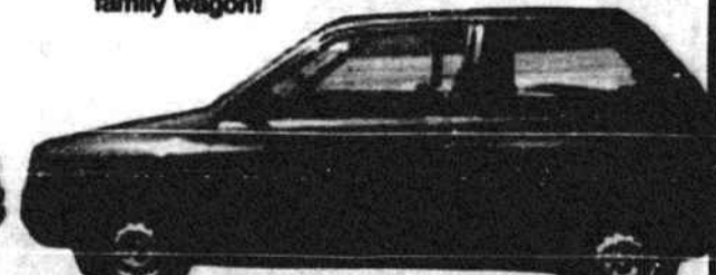
'92 Ford Festiva Economy at its best!

'91 Cadillac Coupe DeVille—full luxury accessories.