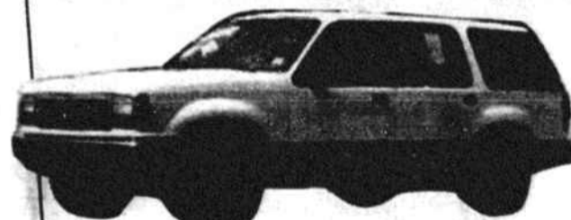
'91 Ford Explorer low miles, auto, 4x4, like new! 90 day/3000 mi. warranty available

Over 50 Cars & Trucks To Choose From! Summer Saving Selections