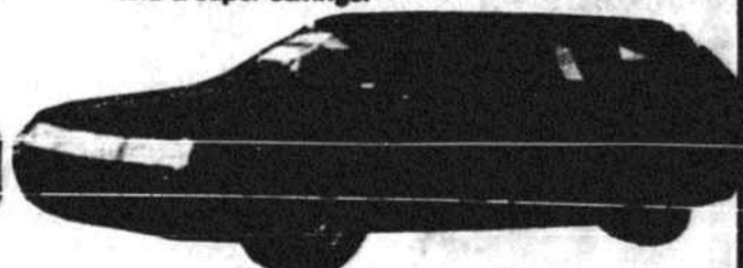
'88 Mercury Sable Station Wagon. 9 passenger, extra nice, 3 seat family wagon!