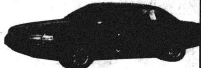
'89 Nissan Maxima 4-door. Showroom clean. Mechanically perfect and a super savings.