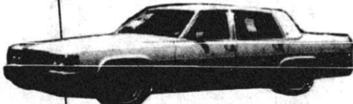
'65 Cadillac Fleetwood Brougham, 4-dr., Real luxury family driving.