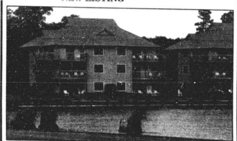
The sun never sets on the fun in this lovely golf course condo on the lake at Oyster Bay. 3 minutes to Sunset Beach, shopping and great food! Beautifully furnished and ready to move in. 2 BR, 2 baths, huge deck. Only $97,900!!!

*** BONNIE BLACK *** ERA MULTI-MILLION $$$ PRODUCER 1993 "I specialize in exceptional properties" ***NEW LISTING***