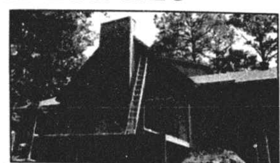
Unique lakefront model home now under construction. Buy now and choose your own interior colors. $135,088, lakefront lot included.

"The Meadows" Wooded Lots at Forest Lake Estates priced $13,500 & up