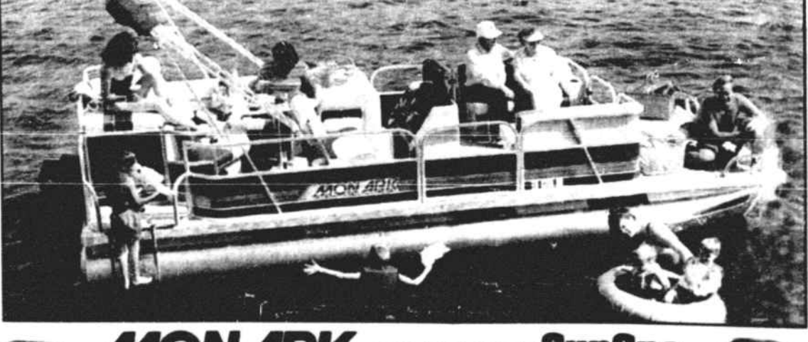
Powered by Mercury Outboards