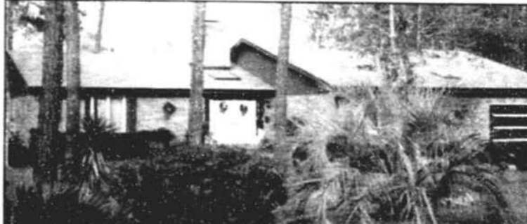
63 CAROLINA SHORES DR —Carolina Shores—2100 sq. ft. of quality. Custom home on 4th fwy. Large GR w/dbl sized brick FP, cath ceilings, beams, skylights, beautiful Carolina rm. with air tight stove, split BR plan. This home has it all!!! $164,000.