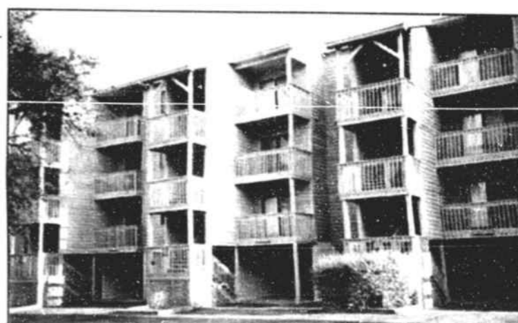
UNIT 1304, MARINER'S WACCHE —Best condo value around!! Beautifully furnished 3-BR, 2 1/2-bath 2-level unit in premiere golfing community on Intracoastal Waterway. Great view from screened porch, parking under building, pool, appliances. Only $99,900.