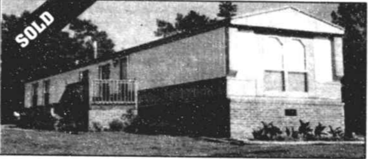
5373 LAKEWOOD DR. —3-BR, 2-bath mobile in mint condition on two lots. Top of line 1991 Fleetwood with brick underpinning, deck, 3 ton air cond., split BR and more!! THIS PLACE IS BETTER THAN NEW!!