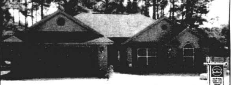
CHARMING 3-BR SPLIT, 2 bath home located in an Intracoastal Waterway community with live oaks and privacy. Eat-in kitchen, cathedral ceilings and screened porch make this affordable home a real buy. ONLY $109,900.