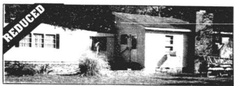
PINE ACRES —Off Hwy. 179 near Ocean Isle Beach. 2-BR, 2-bath mobile home with large 11x23 addition that has vaulted ceiling and fireplace. Beautiful adjacent cleared lot included in reduced price of $26,000.