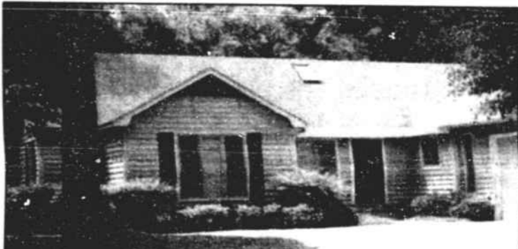
HOLE IN ONE! Sea Trail Plantation. 1936 sq. ft. home situated on corner lot with view of 7th tee on Maples Course. This 3-BR, 2.5-bath home could be YOUR dream come true. $161,000.