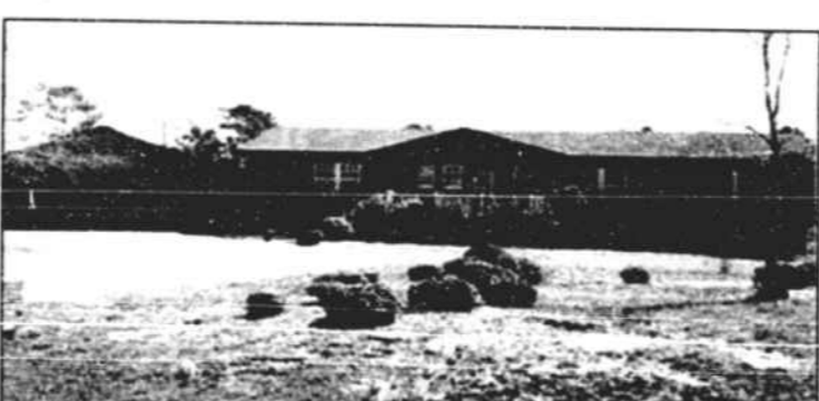
VILLAGE OF CALABASH —This lovely home has 3 BR/split, 2.5 baths, vaulted ceilings, skylights, tile and parquet floors, 2-car garage AND a 30 ft. screened porch. Must see!! A real bargain at $81,300.