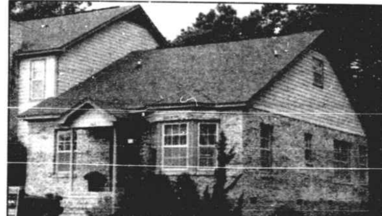
OH!! WHAT A BUY—SCHOONER'S POINTE. So much townhouse for so little money. JUST $68,900. Owner is really ready. A delightful 2-BR, 2-bath townhouse with gas fireplace, large eat-in kitchen with bay window. Just 4 yrs. old, all appliances including washer dryer convey. Seller to credit $1,000 for new carpet. A real bargain and delightful neighborhood.