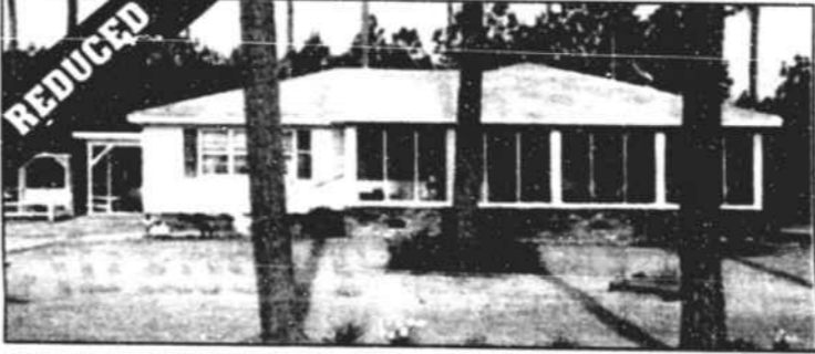
636 THOMASBORO RD., CAROLINA COVE —This home is almost maintenance free. Large rooms with lots of light. Lots of storage, outside workshop, 2-car detached carport. Two large lots with nice yard. Like country living yet near shopping, golf courses and beach. Must see! $89,500.