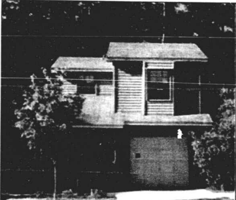
NESTLED IN HIDDEN VALLEY —Contemporary 2-BR, 2-bath upgraded home. Fireplace, skylights and more. Amenities include swim pool. $83,916.