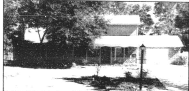
537 GREAT OAKS CIRCLE —Sunset Beach—Spacious mainland home in desirable Shoreline Woods. Situated on lot and a half on "Pretty Pond" with beautiful view from Carolinas room and second floor deck. 4 BR, 3 baths. Garage, huge brk. bar. Vaulted L/R w/skylites and FP. $169,900.