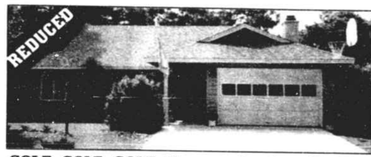
GOLF, GOLF, GOLF til your putter drops—Sea Trail Plantation. Sugar Sands patio home all you could ask for only $139,900. A $10,000 reduction brings this 3-BR, 2-bath home with Carolina room, and large screened porch down to the best BUY IN THE BEST COMMUNITY.