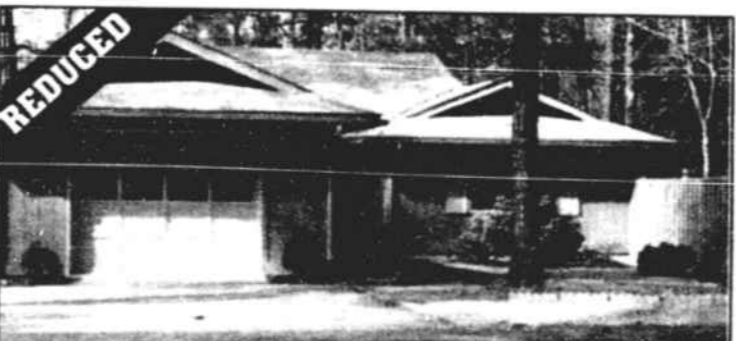
13 GATE 11 —Patio charmer!! Lovely 2 BR, 2 baths on small lot in mature golf course community. Large eat-in kitchen, living/dining area with beautiful screened porch on golf course. $98,100.