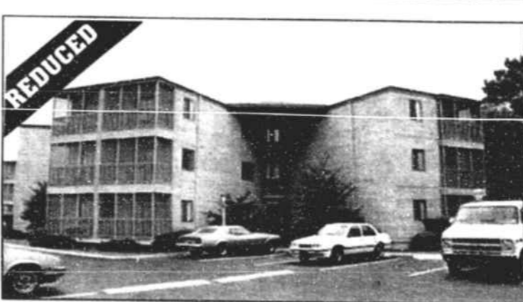
CAROLINA SHORES RESORT —In the heart of Calabash. 2 BR, 2 baths, screened porch, all appliances, excellent condition. Pool and tennis overlooking Carolina Shores Golf Course—Owner says SELL!!! $39,500. *One BR also available at $23,900. Also...1 BR, 1 bath with all appliances and screened porch in excellent condition. $29,000.