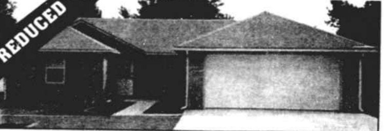
MALLARD POINT —Little River. $13,000 reduction makes this 3-BR, 2-bath brick home the BEST BUY. Almost new, all appliances convey, double garage, large additional screened porch, and large workshop for the handyman. Priced at just $101,500. STOP YOUR SEARCH!!!