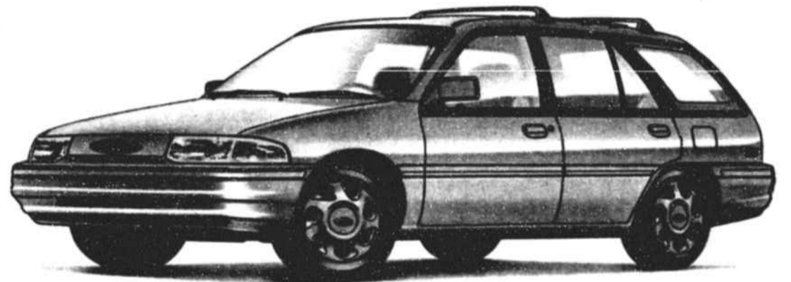
Ford Escort is the best-selling small car in America