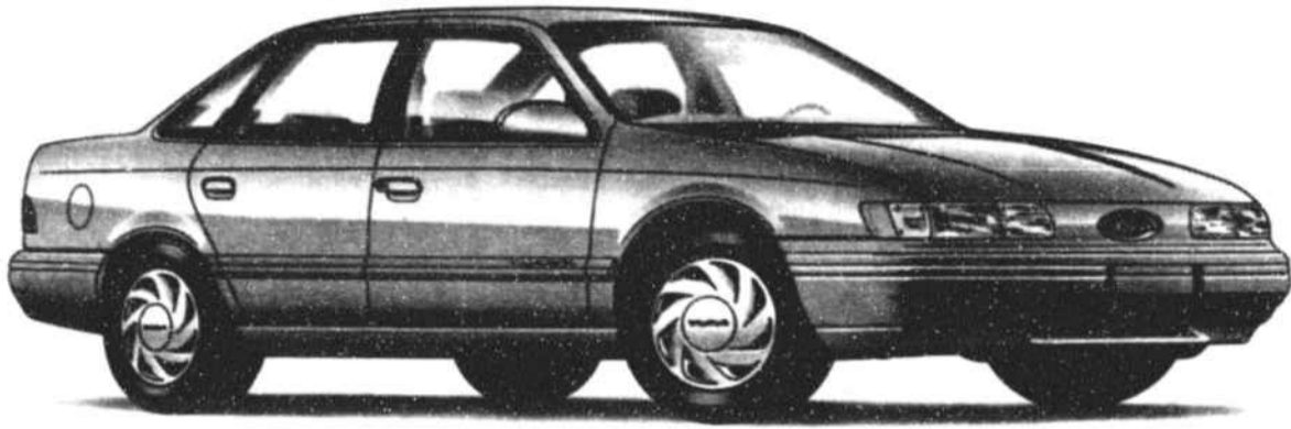
Ford Taurus is the best-selling car in America

FIVE OF THE TEN BEST-SELLING CARS AND TRUCKS ARE BUILT BY FORD. AND IT'S BEEN THAT WAY FOR FOUR STRAIGHT YEARS.