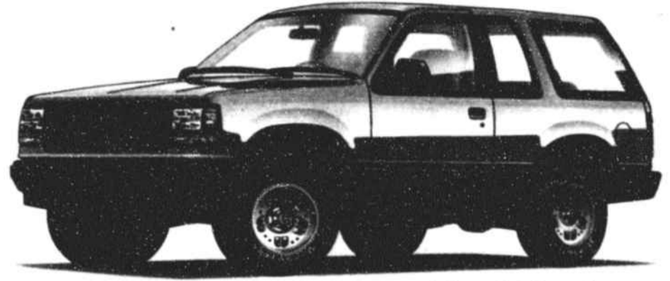
Ford Explorer is the best-selling sport utility in America