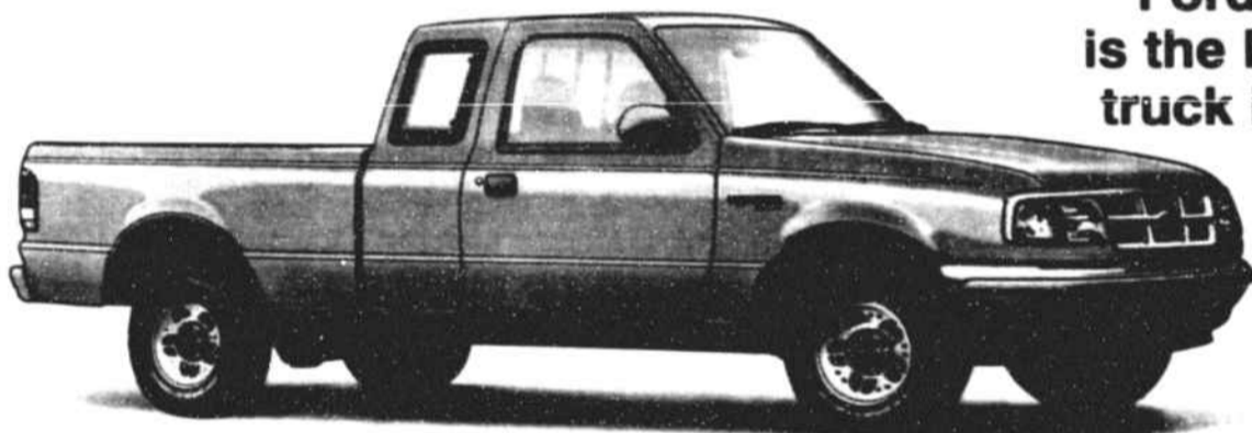
Ford Ranger is the best-selling compact truck in America