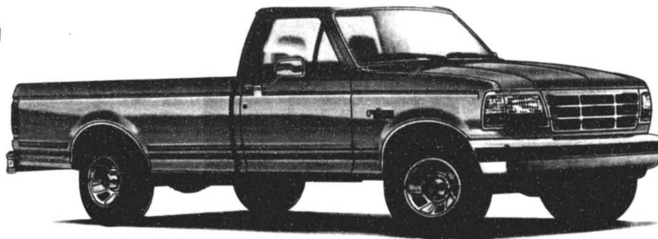
Ford F-Series is the best-selling truck in America