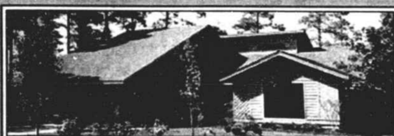
18 CAROLINA SHORES DR. —Contemporary grace and elegance from parquet gallery entry to luxurious master suite w/Jacuzzi and steam shower. Stain grade woodwork with crown mouldings, chair railings and designer papers show off sunken L/R, custom D/R and Carolina room.