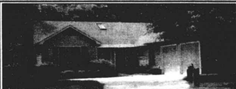
MOTIVATED SELLER has slashed price for this 1936 sq. ft. Sea Trail home situated on a beautiful view of 7th Tee on Maples Course. Call now for details. $161,000.