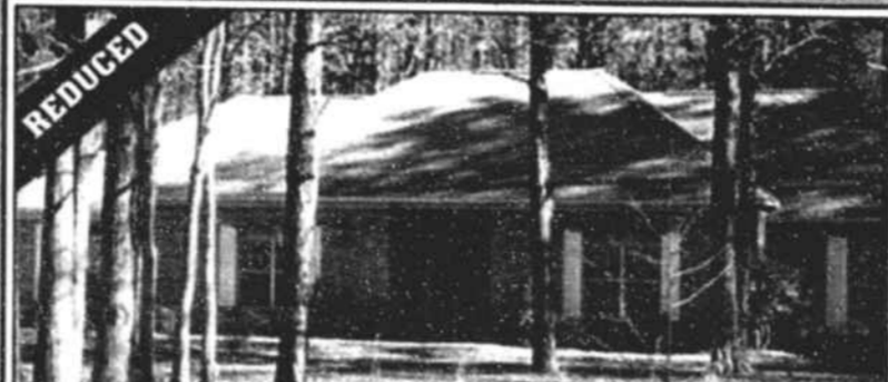
CAROLINA SHORES—GREAT NEIGHBORHOOD —9 Pinewood Dr.—One-of-a-kind home, spacious, open, top of the line appliances, Carolina room, see through fireplace with gas logs. Gas heat, many built-ins, screen porch, located on 1 acre of wooded privacy in golf course community. All brick. It's really beautiful!! $185,500.