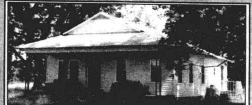
COUNTRY LIVING AT ITS FINEST. This 3-BR, 2-bath home is nestled among 100 year old pecan trees on approx. 5 acres of land with stocked fishing ponds and a barn for your horses. Only $64,900.