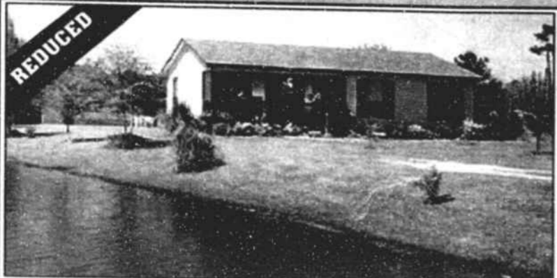
1649 WHITE DUCK COURT —A dollhouse. Both yard and home are perfectly maintained w/pond on 2 sides w/small pier. 3 BR, 1.5 baths, dining area, prch, stor shed, a great starter home, 2nd home or retirement refuge. Must see this lovely yard w/flowers, birch trees & a weeping willow. Affordable. Owner says sell. $69,500.