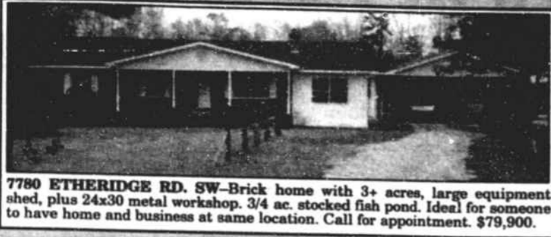
7780 ETHERIDGE RD. SW —Brick home with 3+ acres, large equipment shed, plus 24x30 metal workshop. 3/4 ac. stocked fish pond. Ideal for someone to have home and business at same location. Call for appointment. $79,900.