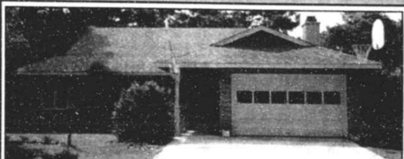
SEA TRAIL PLANTATION—CHOOSE THE BEST —3 BR, 2 baths, garage, Carolina rm., lge. screened porch. Reduced $10,000. Best buy, golf membership and owner will consider rentback. Just $139,900.