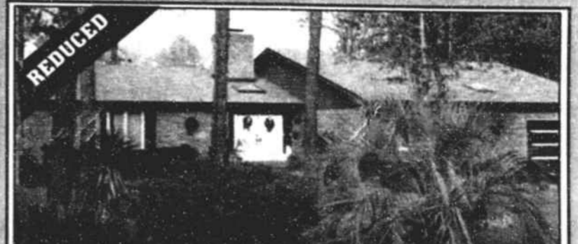
63 CAROLINA SHORES DR.—THIS HOME HAS IT ALL! 2100 ht. sq. ft. of quality. Custom home on 4th fwy. Large GR w/dbl sized brick FP, cath ceilings, beams, skylights, beautiful Carolina rm. with air tight stove, split BR plan. $159,900.