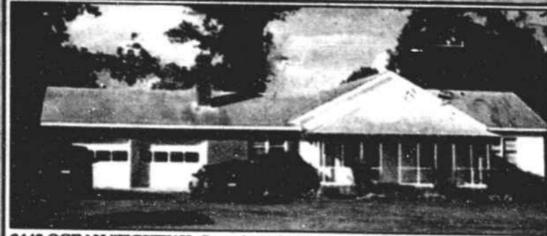
6440 OCEAN HIGHWAY —Great buy! Older 3 or 4-BR home with 2 baths. Has had extensive repairs and improvements made. Large deck, ceiling fans, attic fan. New refrigerator and stove. Many great features. Ideal location for commercial business. Only $69,900.