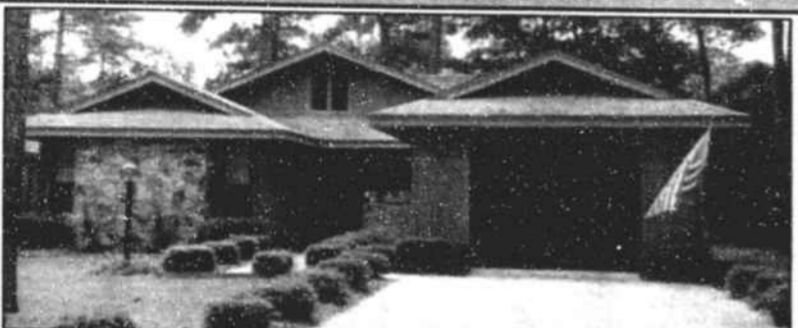
15 GATE 6, CAROLINA SHORES—GOLF COURSE LIVING AT ITS BEST. This lovely home has it all. Open and spacious, overlooking pond and course. Split BR, stone FP, eat-in kitchen, upgraded appliances, skylights, ceramic tile bird bath with established clientele. Only $146,900.