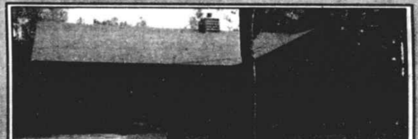
THIS SPECIAL HOUSE is made for a special family. Located on 3.21 acres in a very quiet area. Would be great place for someone who likes horses. This home has 3 BR, 2 baths and a large country kitchen. $59,500.