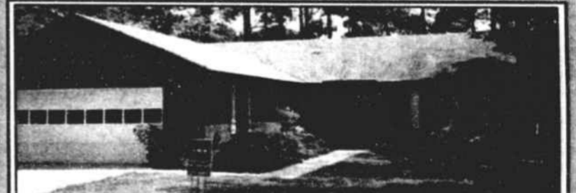
28 GATE 3—Carolina Shores. This is a terrific buy. Beautifully decorated, split BR plan, 2000 ft. +, formals, eat-in kitchen, 2-car garage, corner FP in Carolina room, deck on golf course. Appliances. $142,900.