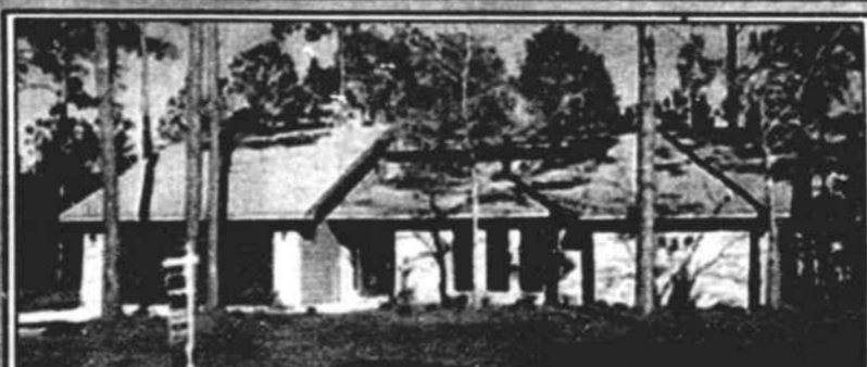
48 PINWOOD DRIVE —Carolina Shores. Large contemporary home on half acre lot is beautiful and affordable. 3 BR, 2 baths, split plan w/stunning vaulted ceilings, sunken family room and terrific kitchen. Light and bright! Decorator colors. Huge Scr. porch and walk-in bar. $159,900.