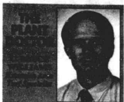
Carolina. Remember to stay at least 25 feet from buildings and avoid planting trees under power lines.