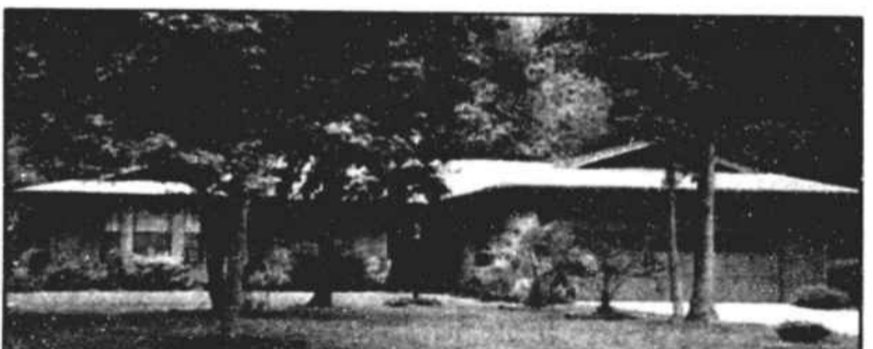
JUST LISTED!! 84 CALABASH DR., CAROLINA SHORES —Lovely bright home with many extras. Large rooms with extra closet space. Many built-in units, split BR plan. Large corner lot.