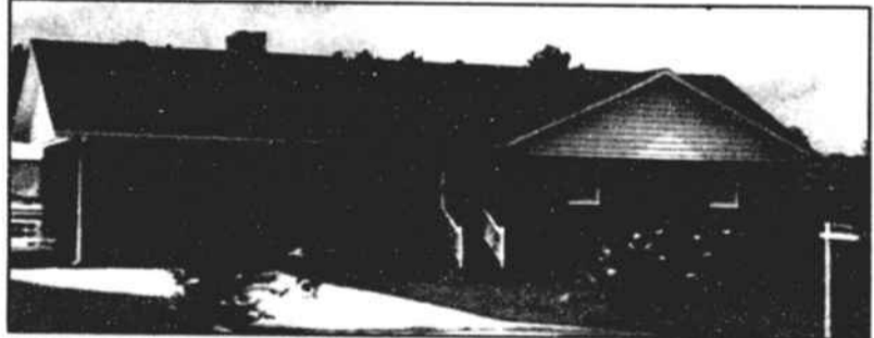
872 CAROLINA ST., CAROLINA COVE —Neat brick home in lovely country setting, large well-landscaped lot, oak cabinets, lg. closets, brick fireplace. Nice screened porch on back. Oversized garage. Call on this one. $87,500.