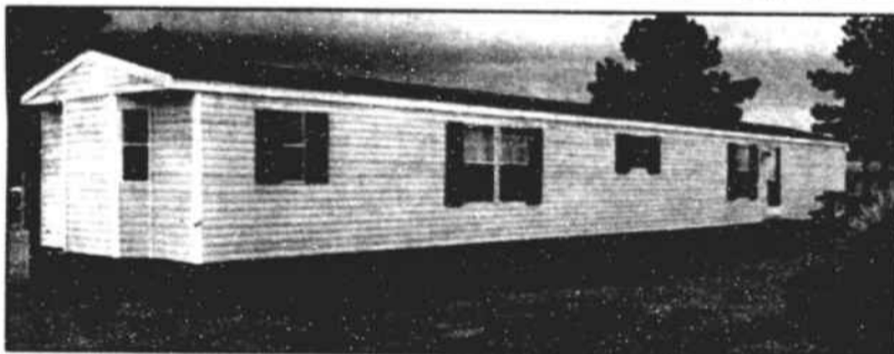
E.F. HUDSON LANE —Located on private road this 2-BR, 2-bath mobile home will give you plenty of peace and quiet. Many extras include island kitchen, dual vanity in master bath and much more. Priced right $39,900.