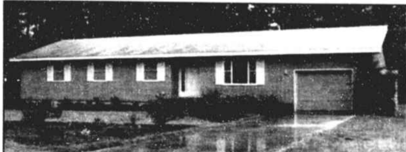
78 COUNTRY CLUB DR. —This is the best priced property in Brierwood!! Spacious rooms w/open fam. room/kitchen area. Formal. Deck. Gar. w/storage. Large Indry rm. Nicely landscaped. Best golf membership around!! $108,900.