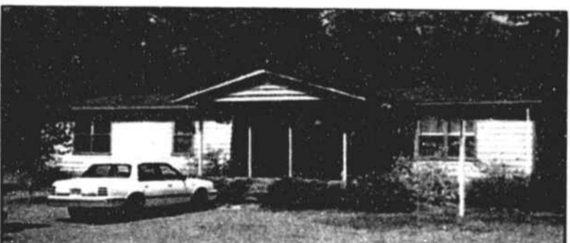
COUNTRY LIVING —This affordable 3-BR, 2 1/2-bath home sits on 8 private acres if you want to live in the country, this is the place for you. Call for details.