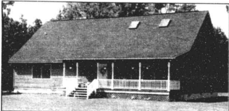
443 PEA LANDING RD. NW —Classic low-country home on acre lot in Calabash area. Home features enormous, open living area and 8x31 covered front porch. Beautiful paneling. Entire 2nd level is master suite. 2800 ft. plus deck and outldg. JUST $117,900.