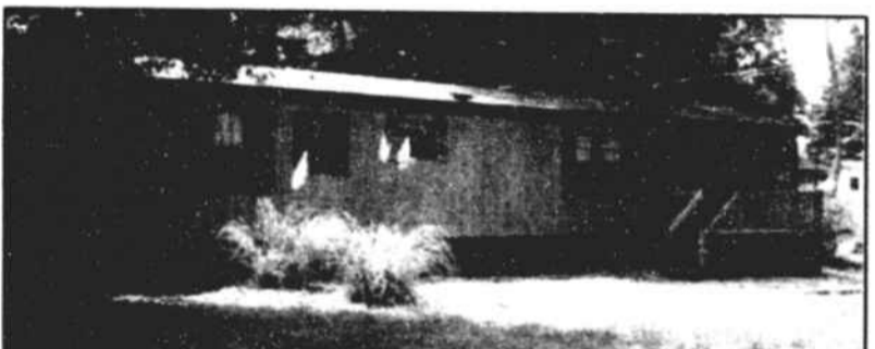
JUST LISTED! 87 GATE II, SEASIDE NORTH —Immaculate mobile home in great location. Split BR plan, deck on front. Nice screened porch back. All furniture and appliances convey!!