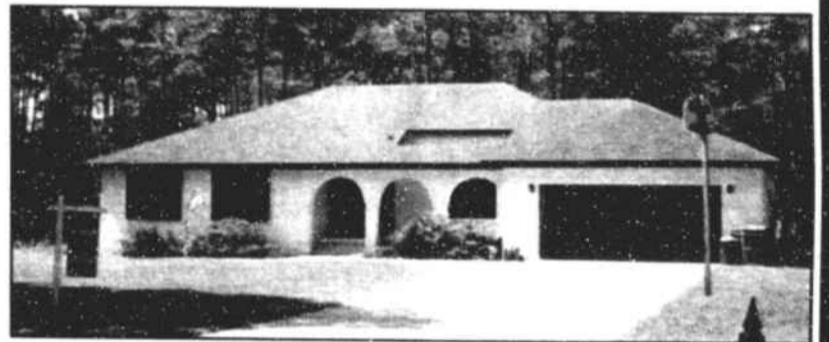
45 FAIRWAY DRIVE —Brierwood Estates—Best priced house in the neighborhood!! Large white brick home with all amenities. 3 BR, 2 baths with screened porch, 2-car garage and more. $134,900.