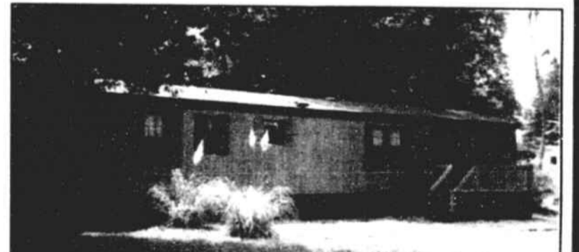
JUST LISTED! 87 GATE II, SEASIDE NORTH —Immaculate mobile home in great location. Split BR plan, deck on front. Nice screened porch back. All furniture and appliances convey!!