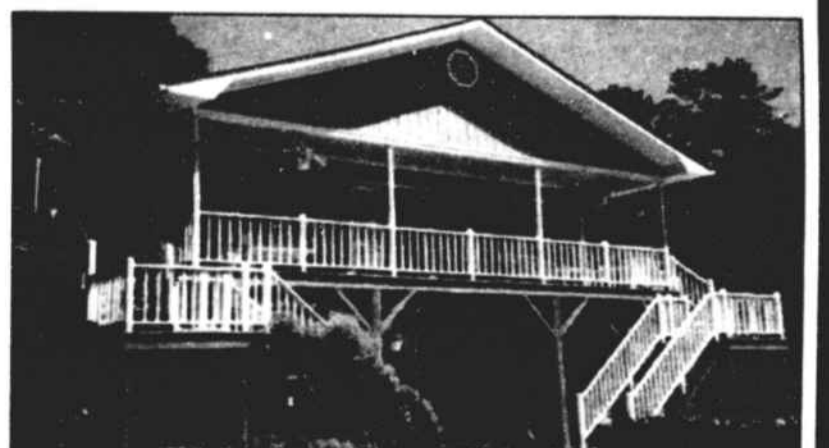
ALMOST-BUT NOT QUITE!!! On the waterway. What a spectacular house designed for the childless couple with one level living in mind. A full separate rentable apartment on first level. Double carport, workshop and separate bathhouse on site. Waterway access community. A delightful surprise for the right buyer. $144,900.