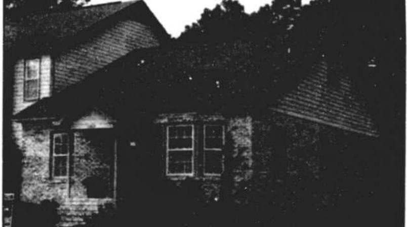
A COZY TOWNHOUSE —Available for just the right couple who want no yard work, like 2 BR, 2 baths and large eat-in kitchen, screened porch and close to the waterway. A great permanent or second home. Only $68,900.

Stop By Our Office For A Complete Listing Of Properties For Sale !