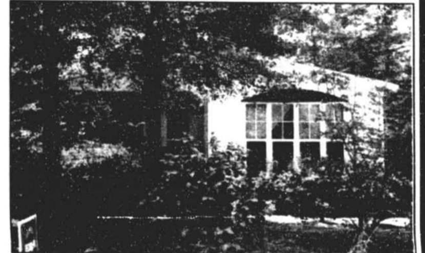
1546 GATE II SW, SEASIDE NORTH —Looking for the best buy on the market? This is it! 3 BR, 2 baths. Large open kitchen with all appliances. Screened porch, carport. Great community with pool. Only $57,900.