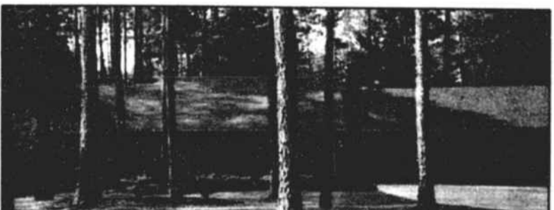
15 SUNFISH COURT, CAROLINA SHORES —Lovely, well-maintained home with view of green. 1800 sq. ft., well designed, Car. rm., oversized gar., large MBR. You must see this great location and home. Priced right. $159,000.