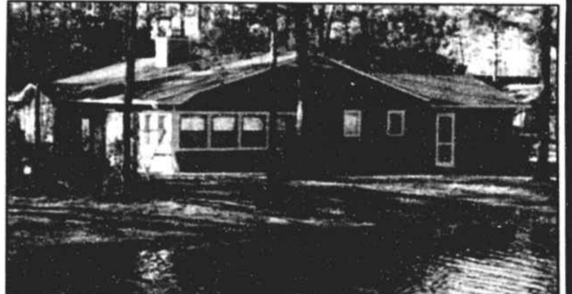
#9 COURT 12-NORTHWEST DR., CAROLINA SHORES —This home overlooks the 6th tee and a pond on the course. Perfect home for retirement or home away from home. Great view from enclosed porch. Super price. Community has pool, tennis, picnic area and clubhouse. ONLY $94,900.