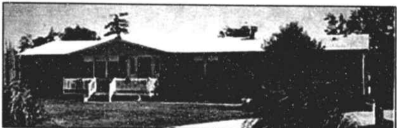
DREAMS CAN COME TRUE! Priced thousands below replacement cost. Owner financing. 3 BR, 3 baths and loaded with extras. 4 years new at The Village at Calabash a community with amenities. Call today! Only $86,400.