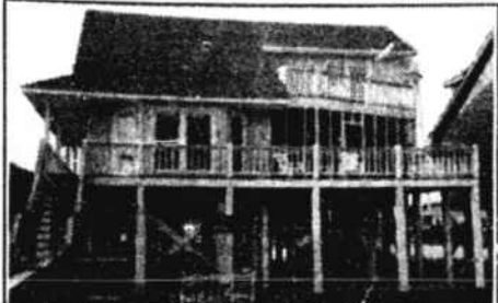
139 Ocean Blvd. W .....$257,500.