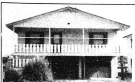
548 Ocean Blvd. W .....$124,900.