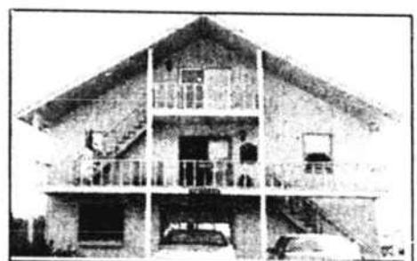
Sea Aire Canals .....$135,000.