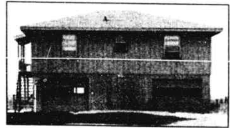
765 Ocean Blvd. West ..$159,900.