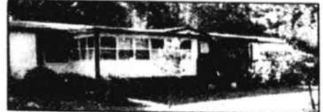
2706 Eleanor Dr .....$89,900.