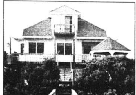
Sea Aire Canal .....$262,500.

Commercial—Bypass 17, 8.638 acres, road frontage—925.33 per acre .....$10,000-$20,000. 11.86 Acres, Shallotte River .....$350,000.