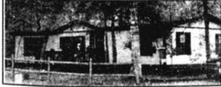
Gator Grant Doublewide..$65,900.