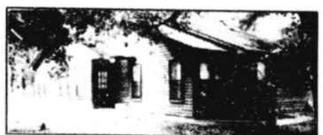
7277 Nursery Rd. SW ..$104,500.