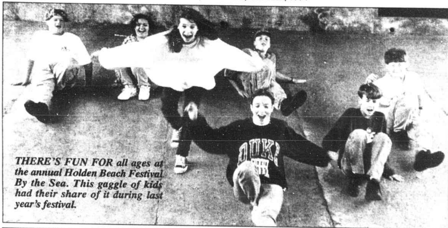
THERE'S FUN FOR all ages at the annual Holden Beach Festival By the Sea. This gaggle of kids had their share of it during last year's festival.