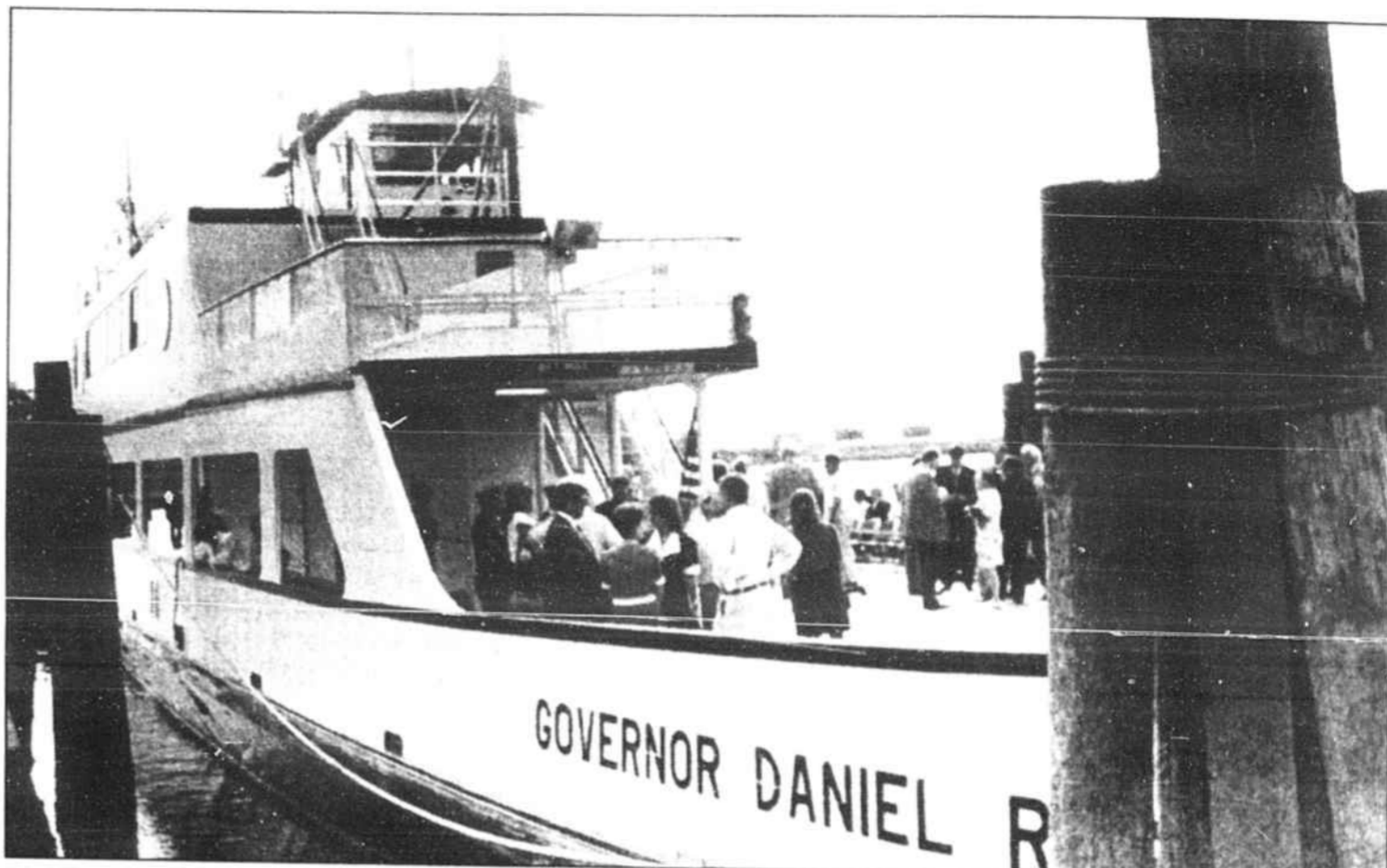
THE GOVERNOR DANIEL RUSSELL is the lead vessel in the Southport-Fort Fisher ferry that makes the Cape Fear River crossing many times each day.

✓ If you are storing your boat on land, take out the battery and keep it in a dry, warm place. If you're keeping your boat in the water, be sure to keep the battery charged for the bilge pump and check on your boat regularly to guard against problems caused by freezing and power outages.