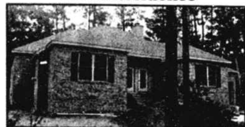
Model Home—Front View