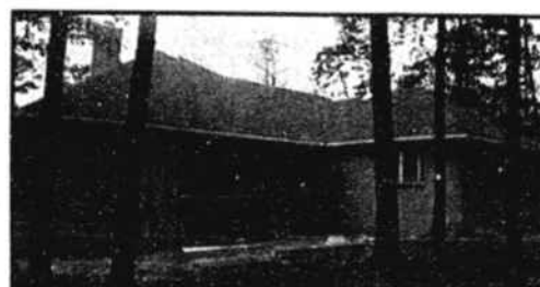
Model Home—Back View

Interior selections may still be made on this spacious 1800 sq. ft. home. $168,847 includes golf course homesite. Call for details.