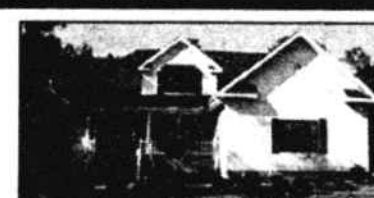
1660 Creek Circle