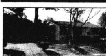
3807 Holden Rd. Shallotte Point