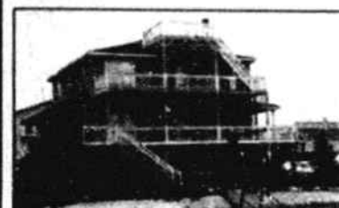
50 Anson St. Canal

Drop by our office for information on our full listing.