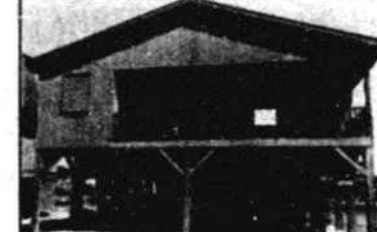
6 Wilmington St. Canal