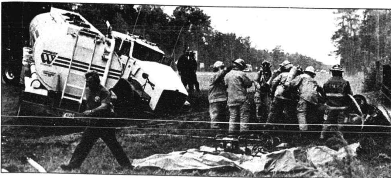
RESCUE WORKERS prepare to use a Hurst cutting tool to remove the body of an unidentified woman from a car that burst into flames after it was hit by a tractor trailer truck while trying to cross U.S. 17 near Calabash Tuesday afternoon.