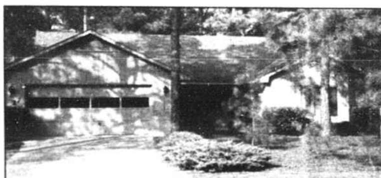
CAROLINA SHORES DRIVE —Perfectly maintained, this home has it all!!! Parquet foyer, great room with brick fireplace opens onto Carolina room, eat-in kitchen. 3 BR, 2 baths, and 2-car garage. Priced to sell. $137,500.