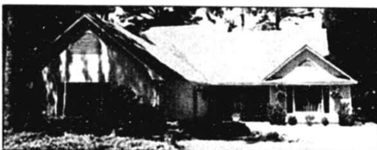
SEA TRAIL —Sunsets you won't believe!! Observation deck and scr. porch w/great view over 2 fwys. of Oyster Bay 2-BR contemporary sweeps to lg. loft/3rd BR w/full bath and study. Stunning master bath w/dbl. Whirlpool. Golf membership transferable. $195,000.

New construction, this 3-BR, 2-bath home should be completed in Nov. This house will be light and airy with fireplace in great room. Choose carpet, wallpaper and paint. Call for more details.