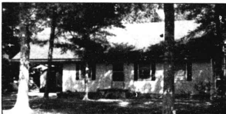
JUST FOR YOU —A great family home priced to sell at $68,444. 3 BR, 2 baths, living room, dining room and separate kitchen. In Water Wonderland community and close to shopping. Call now to see