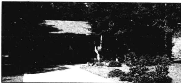
460 EGRET DRIVE, SEA TRAIL PLANTATION —Fabulous buy on most desirable golf course community in So. Brunswick Islands! 3 BR, 2 baths on lovely landscaped lot. Screened porch. All appliances. 2-car garage and more!! Only $179,900!!