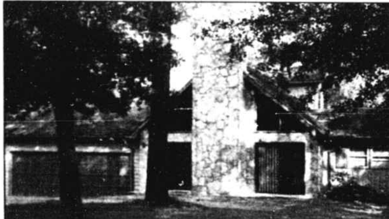
WATER-WATER-AND MORE WATER —If it's a view you want, try this spectacular cozy home at Sandfiddler Cove, Sunset Beach. A great new small subdivision, with an existing house overlooking the Calabash River. Privacy, space and peace is all here and only priced at $142,500. Come discover your new neighbors and a place you can call HOME.