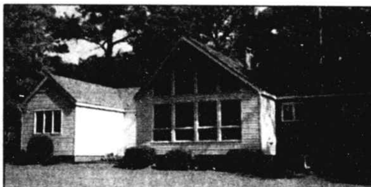
WATERVIEW —Overlooking the Saucepan Creek. This 2-BR + loft, 2-bath home with vaulted ceiling, fireplace, exceptional landscaping will enchant you. Home warranty also. $122,900.