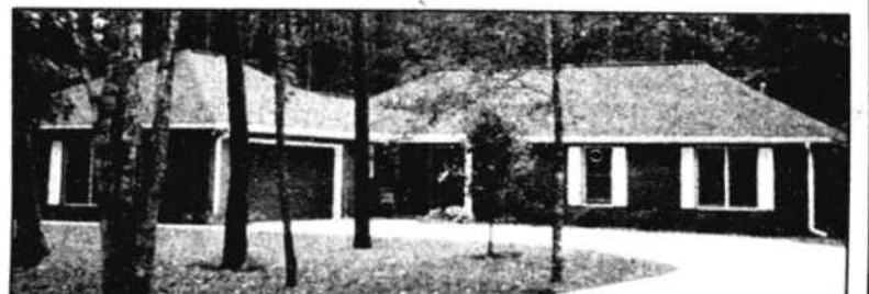
48 SUNFIELD DRIVE, "COUNTRY FEEL" —Brick ranch w/large lot and lots of trees. 2 BR, with den/3rd sleeping area. Tray ceiling in light bright great room. Tile foyer, kitchen and baths. Gas fired heating. Extras!! $129,900.

Exterior of this 3-BR, 2-bath manufactured home is completely bricked. Home offers many extra features including 22x19 family room. Skylights, ceiling fans, great kitchen and many more extras. Unbelievable price! Call for details.