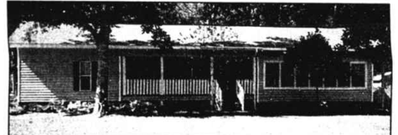
WHAT A SURPRISE you'll find in this totally remodeled 1466 sq. ft. home located on a corner lot in Seaside Station, a waterway community at Sunset Beach. $63,500.