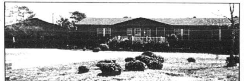
VILLAGE OF CALABASH —This lovely home has 3 BR/split. 2.5 baths, vaulted ceilings, skylights, tile and parquet floors, 2-car garage AND a 30 ft. screened porch. Must see!! A real bargain at $81,300.