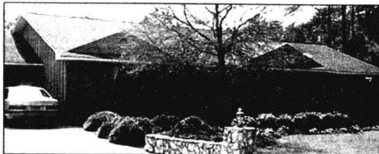
LITTLE RIVER, SC, 4270 GRAYSTONE BLVD. —Over 2270 sq. ft. in this 3-BR, 2½-bath home in nice subdivision. Enter foyer on parquet floor with angled walls leading to LR or MBR. Split BR plan, MBR opens on deck, also has whirlpool tub. Eat-in kitchen, fireplace, large deck. Too many extras to list. A must see. Call for appointment. $132,500.