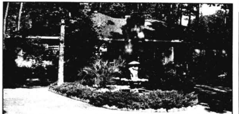
4 MOSS CT., CAROLINA SHORES —A home of distinction! 3-BR, 3-bath home has special amenities. Intercom & Security systems, huge master bath w/onyx whirlpool, shower and vanities, tile baths and entry, circle drive on quiet cul-de sac. $184,900.