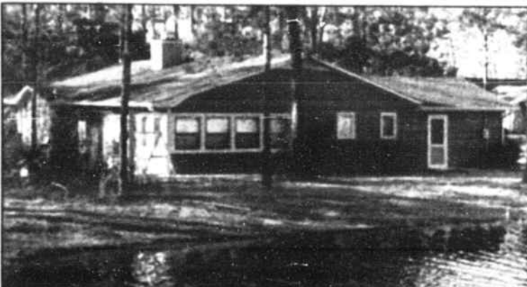
#9 COURT 12-NORTHWEST DR. —This home overlooks the 6th tee and a pond on the course. Perfect home for retirement or home away from home. Great view from enclosed porch. Great price. Community has pool, tennis, picnic area and clubhouse. ONLY $94,900.

Come see what you have to choose from when you visit our office.