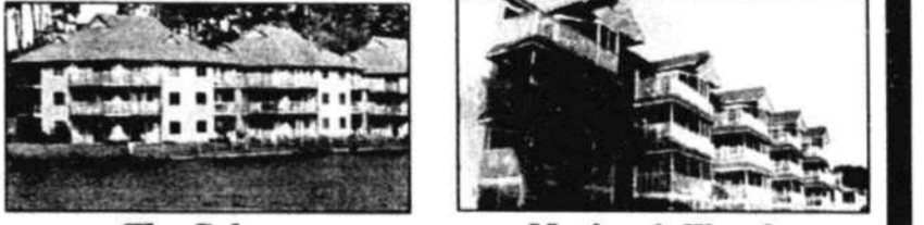
The Colony Oyster Bay Golf Course Mariner's Wacche Brick Landing Plantation