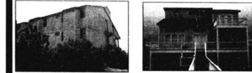
140 East 1st St. Oceanfront 360 East 1st St. Oceanfront

Drop by our office for information on our full listing.