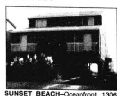
SUNSET BEACH-Oceanfront. 1306 E. Main St. This is your chance to afford this pristine location. 3-BR, 2bath duplex. Great rental property.