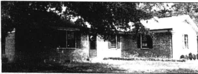
1033 FAYETTEVILLE AVE., CALABASH ACRES —Lovely brick house backing up to lake in riverfront community. Nice screened porch plus extra workshop or garage. All appliance convey. 5 fans, ample closets, gas furnace for auxiliary heat. Must see to appreciate!