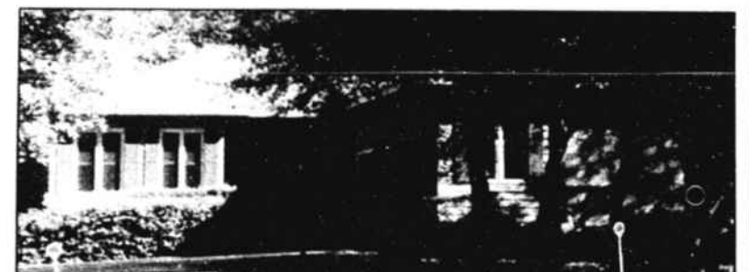
SEA TRAIL PLANTATION —Home prepared for just the right buyer. Price reduced and ready to move in. 3 large BR, 3 baths, and a view of the golf course. $192,900.