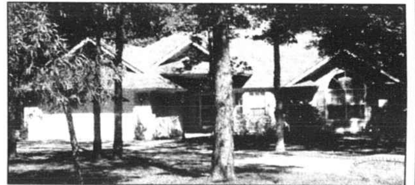
1 ARDEN CT. —A beautiful home with true custom upgrades! Beautifully landscaped corner lot w/circle drive. Vaulted LR has FP, built-ins, Palladium window. 2/3 BR, large kitchen/dining room and MORE!! $159,900.