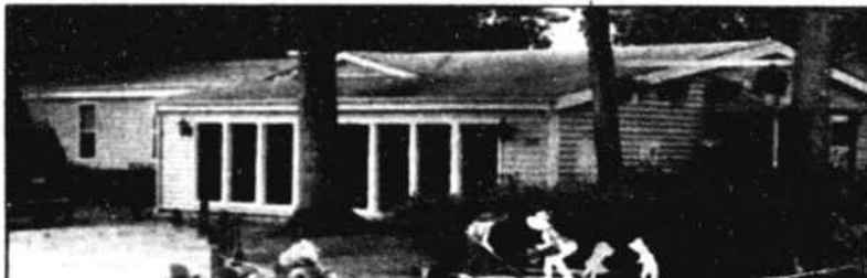
1920 KITTRELL DR. SW —Spacious 2-BR, 2-bath home recently remodeled. Large 150x130 lot w/circle drive. Several outbuildings and amenities make for enjoyable living! Near ICW $87,900.