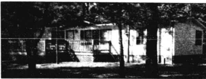
1460 HICKMAN CROSSROADS —This home was built with extras. 3 fans, corner FP, skylights, walk-in closets, cedar lines, wrap-around decks, 2 wells, storage shed (8x16). This is country living. Yard is completely fenced in. Brick underpinned, underground utilities. Stocked pond, storm windows and doors. Insulated front and deck door.