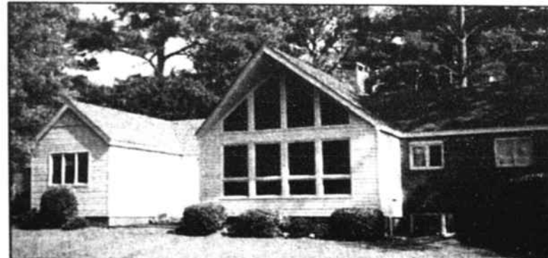
LIKE A NEW PENNY —This home outshines its competition. Overlooking the Saucepan Creek this 2-BR plus loft, 2-bath home with vaulted ceiling, fireplace, and picturesque setting will enchant you. Home Warranty. $122,900.