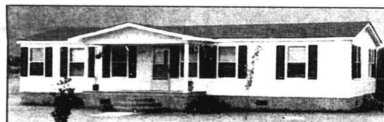
7126 CEDAR CT., GREENBRIAR —Ideal place for someone who wants nice quiet area in country. Almost 3/4 acres. Great 1st home or retirement place near beaches and several golf courses. Fenced backyard. Storage shed, water conditioner convey.