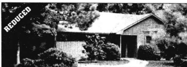
17 CAROLINA SHORES DRIVE —Relax and enjoy life in this 3-BR home with 2 baths, brick FP and naturally landscaped maintenance-free yard. If you enjoy golf more than yard work then come see this lovely home. Community has pool, tennis, picnic area, clubhouse, and lots of activities!!! Reduced to $94,900.