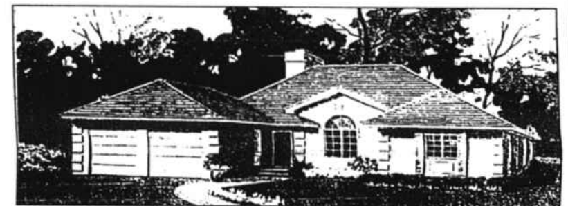
5 BAYBERRY CIRCLE —New construction, this 3-BR, 2-bath home should be completed soon. This house will be light and airy with fireplace in great room. Choose carpet, wallpaper and paint. Call for more details.