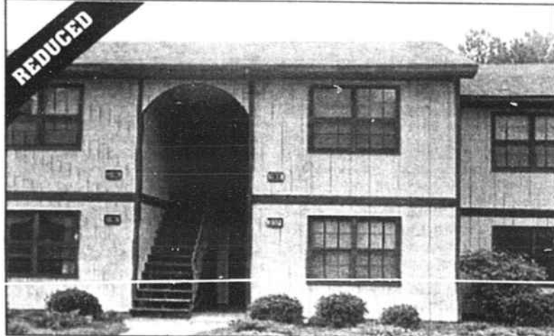
UNIT 308 BRIERWOOD VILLAS II —Brierwood Estates. Golfers, take note!! You cannot buy more reasonably on a golf course where members are treated better! 2-BR, 2-bath unit w/gorgeous view. $56,400. Reduced membership available.