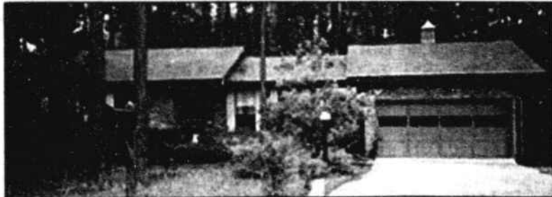
1 YELLOW JACKET CT.—BRICK —3 BR, 2.5 baths, new HP, new hot water heater, 2-car garage. Painted 1993, corner lot, brick FP. This property is a good investment. Good rental history. All this for under $100,000.