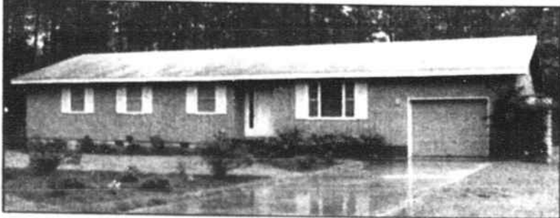
78 COUNTRY CLUB DR. —This is the best priced property in Brierwood! Spac. rms w/open fam. room/kitchen area. Formal deck. Gar. w/storage. Large laundry rm. Nicely landscaped. Best golf membership around!! $108,900.