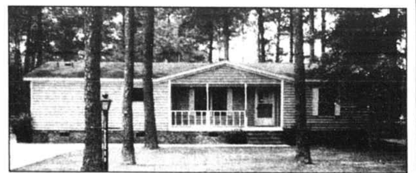
YOU'LL FALL FOR this 3-BR, 2-bath home that's in move-in condition. Offers an elegant master suite, split plan, eat-in kitchen and Carolina room. Located in Ocean Forest on a wooded lot. $63,900.