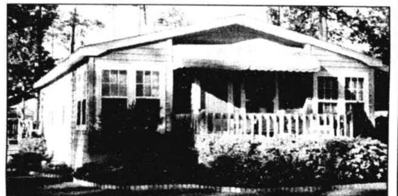
GREAT HOME in established community with pool, tennis and lots of activities. Deck, skylights, fireplace, garden whirlpool tub, icemaker, cent. stereo system, mini-blinds, nicely landscaped. $78,900.

Sea Trail Plantation Lot Just off fairway $49,900 Priced to sell.