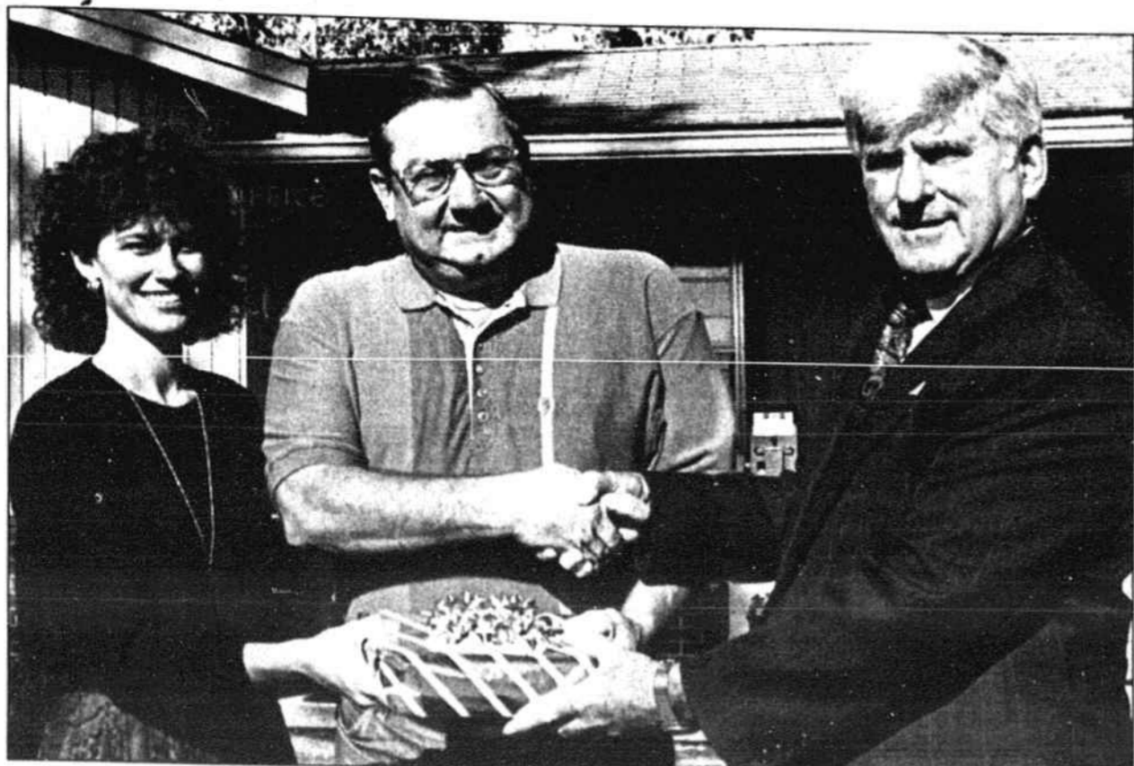
Customer For 44 Years