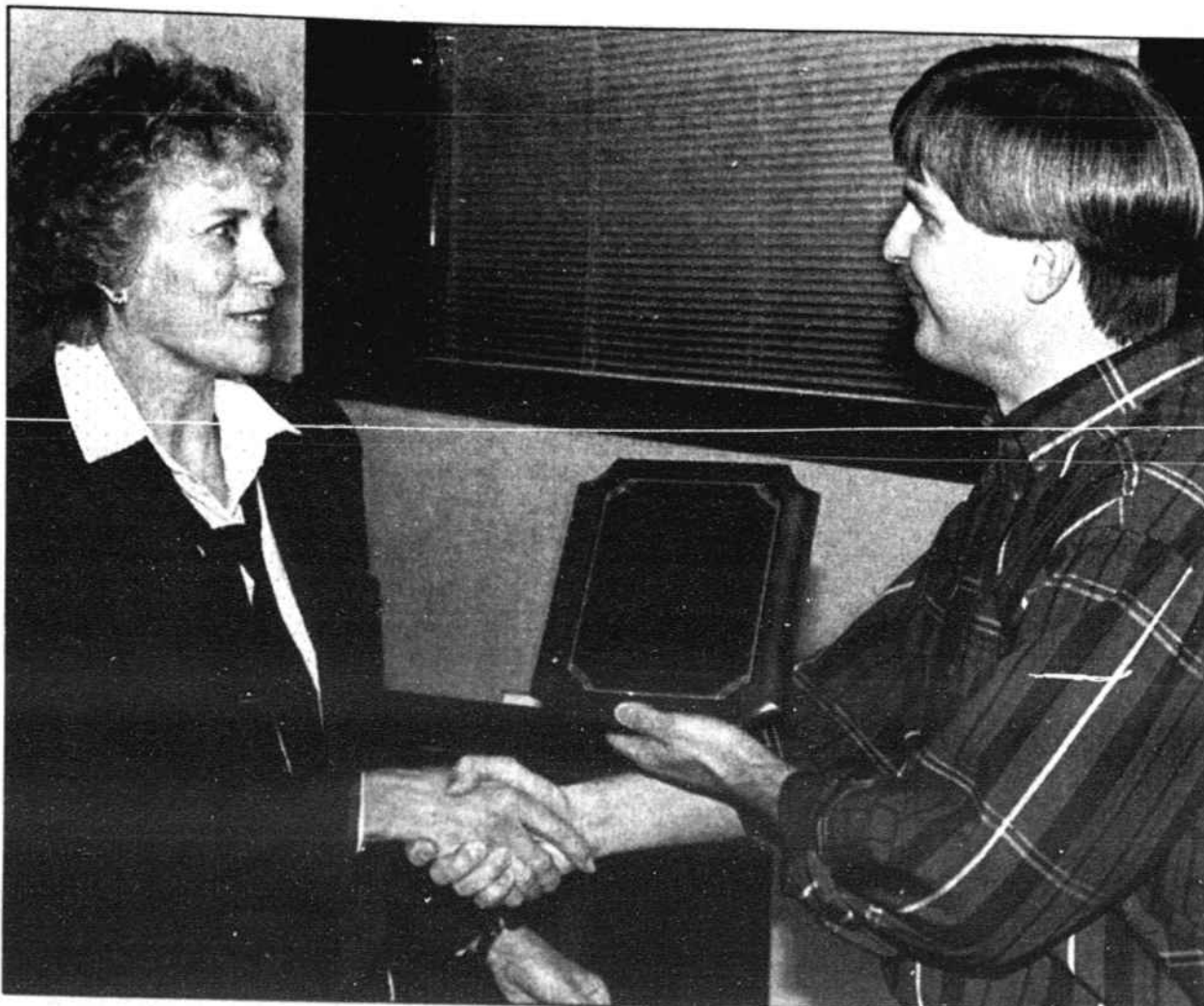
Employee Of The Year