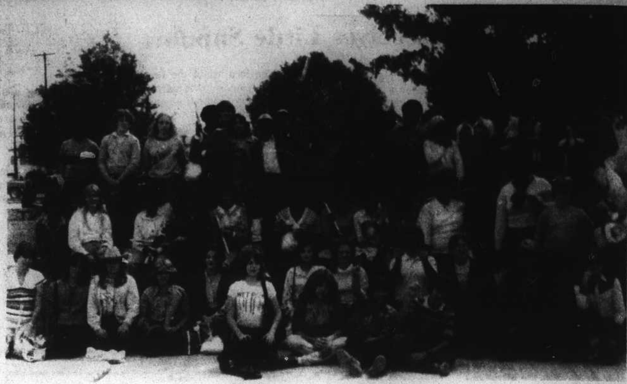
This picture was taken at the Scott Building on the grounds of the North Carolina State Fair in Raleigh, Wednesday, October 22. Several bus loads of Pamlico County students enjoyed a day of rides, footlong hot dogs and games.