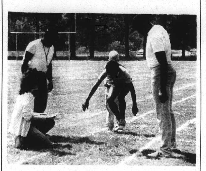
The broad jump was one of the events at the Pamlico Special Olympics