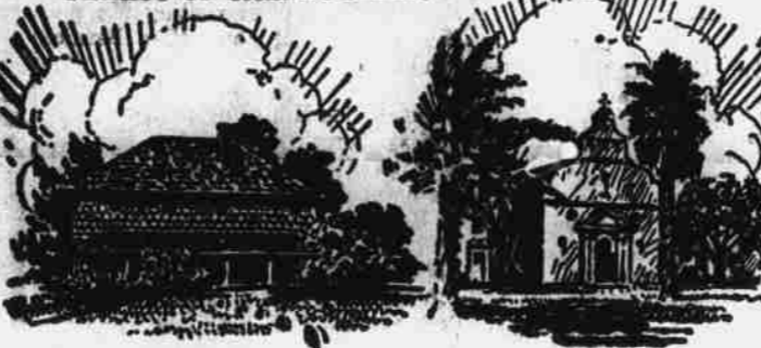
—QUAKER— FRIENDS MEETING HOUSE, FLUSHING, L.A. 17 th CENTURY

AMONG OUR FIRST SETTLERS WERE MEN AND WOMEN WHO WERE WILLING TO BRAVE A NEW WILDERNESS IN ORDER TO LIVE OPENLY ACCORDING TO THE TENETS OF THEIR BELIEF.