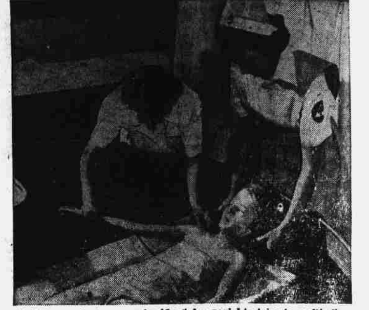
Red Cross volunteer nurse's aides take special training to qualify them to artist pireintierapists in pollo treatment. Last year these workers fals and of rr :