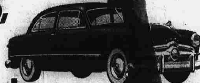
'49 Ford four door sedan