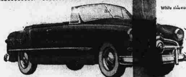
'49 FORD convertible

Take the Wheel... Try the "Feel" At Your Ford Dealer's Today!