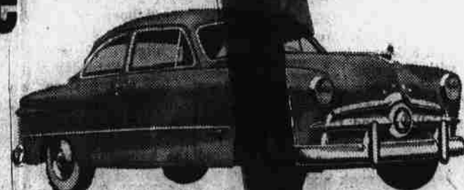
'49 Ford two door coupe

Yes, feel Ford's Brakes They're 3" wide to apply because they're King-Size with "Magnum" brakes.