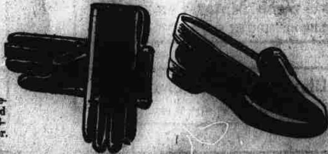
Fig-grain cape-skin... rolled cuffs. Size 8-10 1/2; cork color.