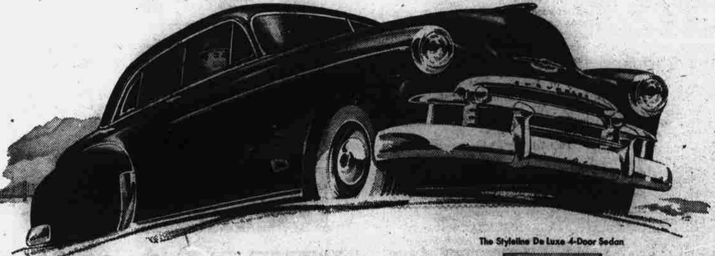
The Styleline De Luxe 4-Door Sedan

in the low-price field gives you all that's beautiful . . . all that's thrilling . . . all that's thrifty!