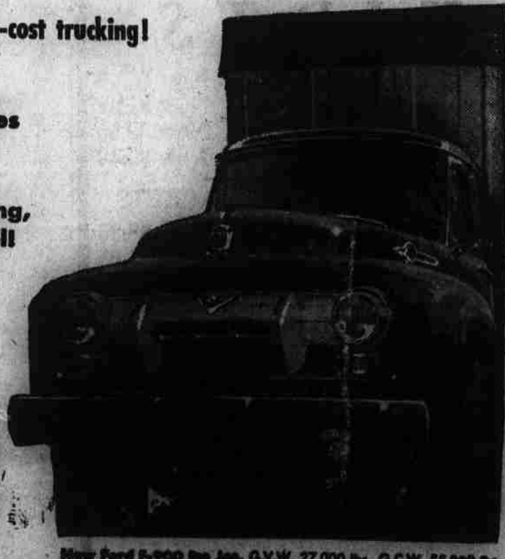
New Ford F-900 Six Cab, G.V.W. 27,000 lbs., G.C.W. 55,000 lbs.

WINSLOW - BLANCHARD MOTOR COMPANY Your Ford Dealer Hertford, N. C.