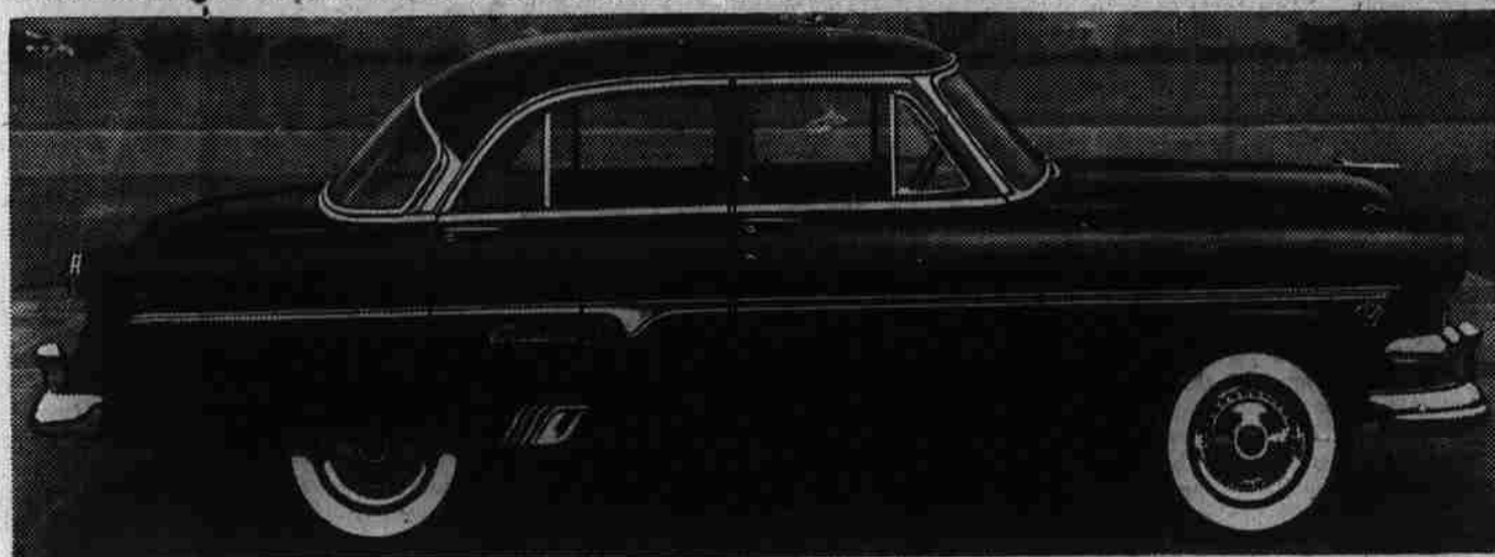
Fine-car Styling An outstanding example of fine-car beauty in the low-price field... the new Crestline Ford is the fashion car for the American Road.