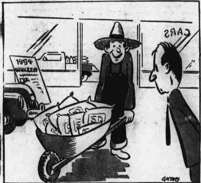
"My neighbor said only $400 worth of Smith-Douglass Fertilizer bought him a new car."

THE NORFOLK & CAROLINA TELEPHONE & TELEGRAPH COMPANY Elizabeth City - Edenton - Manteo