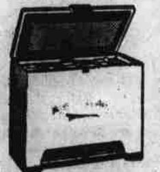
COMPACT 11-CU-FT HOLDS 385 POUNDS

Fits in most any kitchen. Features new Tilt-Stor Door Shelf, sliding adjustable shelf, 3 freezing shelves, Frozen Juice Can Dispenser — plus many more wonderful conveniences. Refrigerated top and bottom!