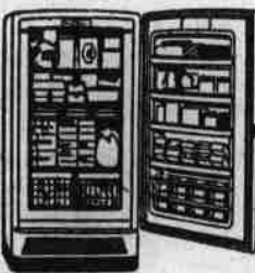
UPRIGHT 11-CU-FT HOLDS 385 POUNDS

Takes less than 3-1/2 ft. floor area. New Ice Cream Conditioner. Space Maker Door Shelves. Roomy Stor-Well and Baskets. Frozen Juice Can Dispenser. Five refrigerated surfaces — 3 freezing shelves. Most complete freezer ever offered!