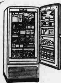
UPRIGHT 15-CU-FT HOLDS 525 POUNDS

Takes less than 3-1/2 ft. floor area. New Ice Cream Conditioner. Space Maker Door Shelves. Roomy Stor-Well and Baskets. Frozen Juice Can Dispenser. Five refrigerated surfaces — 3 freezing shelves. Most complete freezer ever offered!