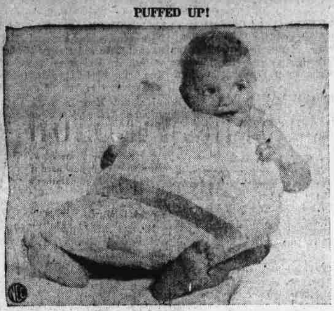
Here's something to get all puffed up about! It's the biggest cotton powder puff ever made. The huge two-foot powder puff was made by the Hygienic Company to mark the manufacture of its billionth puff. The company estimates that in the last fifty years it has used about four million pounds of cotton to keep the ladies and babies in powder puffs. At first goose down was used, but in 1906 cotton velour was introduced and immediately became popular.

Better compact never came than this one. It's the only compact and the only one with constant slide.