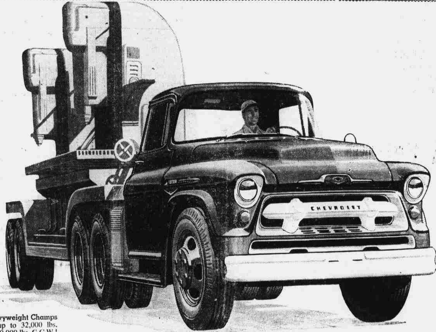
New Heavyweight Champs — rated up to 32,000 lbs. G.V.W., 50,000 lbs. G.C.W.!