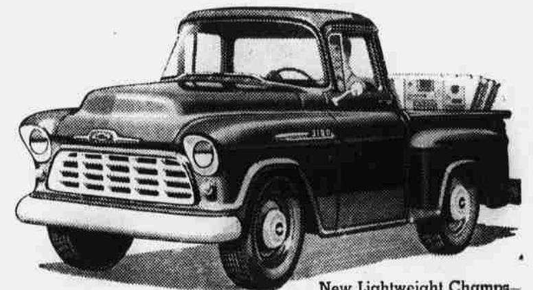
New Lightweight Champs—most modern in their class!

New models to do more and bigger jobs! New heavy-duty series rated up to 32,000 lbs. G.V.W.! New power right across the board! New automatic and 5-speed transmissions! Now there are more reasons than ever why anything less is an old-fashioned truck!