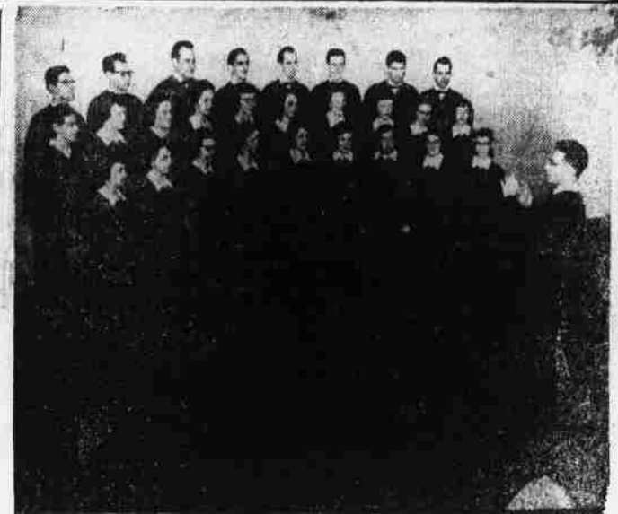
A 26-voice choir, representing Cleveland Bible College, now on its annual spring tour, will present a concert of sacred music at the Up River Friends Meeting House in Whiteston at 8 o'clock next Monday night.

A number of Hertford stores will be closed all day next Monday in observance of Easter Monday, a holiday which these stores have been observing for the past several years.