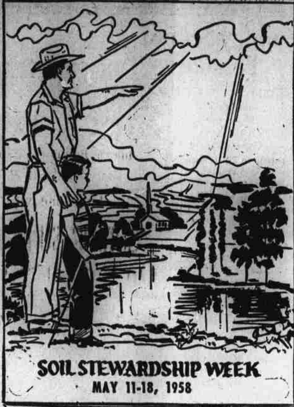
SOIL STEWARDSHIP WEEK MAY 11-18, 1958

A happy childhood is one of the best gifts that parents have in their power to bestow. —Mary Cholmondeley.