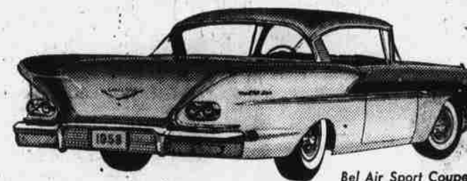
Bel Air Sport Coupe