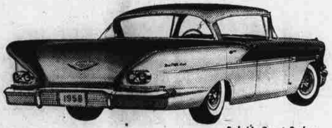
Bel Air Sport Sedan