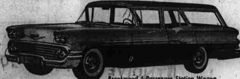
Brookwood 6-Passenger Station Wagon