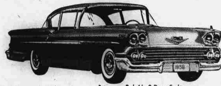
Bel Air 2-Door Sedan