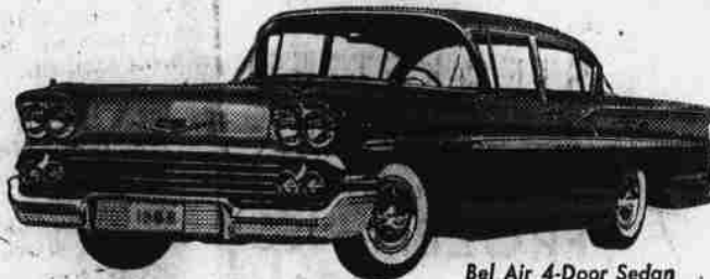
Bel Air 4-Door Sedan

TOP TV—The Dinah Shore Chevy Show—Sunday—NBC-TV and Pat Boone Chevy Showroom—weekly on ABC-TV.