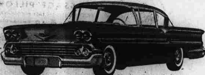
Biscayne 2-Door Sedan