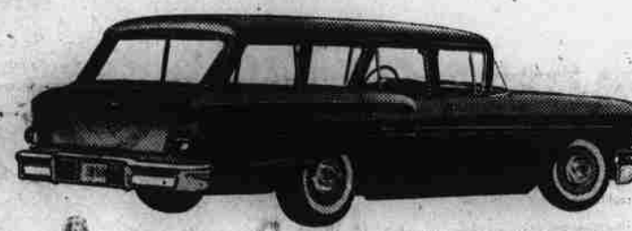
Brookwood 9-Passenger Station Wagon

Every one of these low and lovely Chevrolet V8 sedans, hardtops and wagons costs less than any comparable model in the low-priced three. No other cars are so big, so beautiful—yet go so easy on your budget!