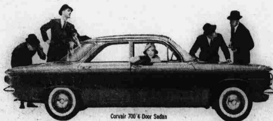
Corvair 700 4-Door Sedan

Drive it—it's fun-tastic! See your local authorized Chevrolet dealer for fast delivery, favorable deals.