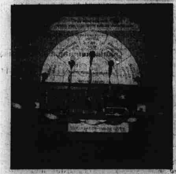
4.H members and community clubs make exhibits for many occasions. This one was put up at 4-H. Achievement Day in 1959.