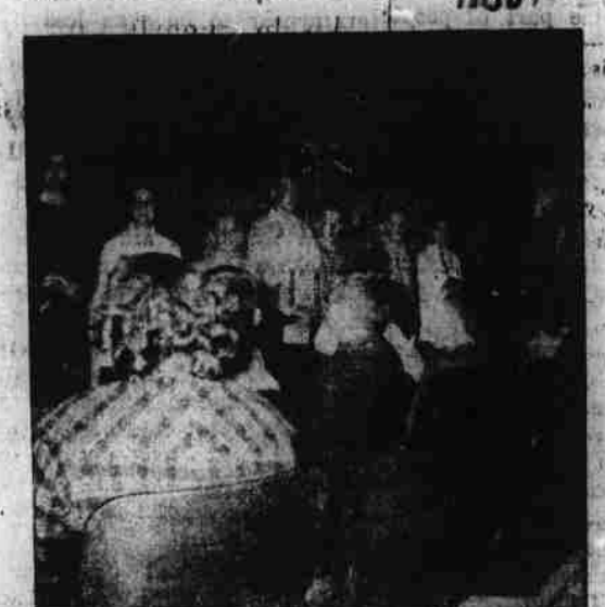
At the end of the 4-H year, County Winners in the various projects are selected and awarded Certificates and Medals for a job well done.