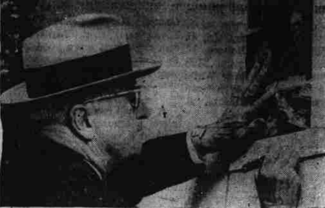
"AUTOGRAPH, MR. PRESIDENT?"—Former chief executive Harry Truman pauses during a morning stroll in New York to sign his photograph on the request of a resident.