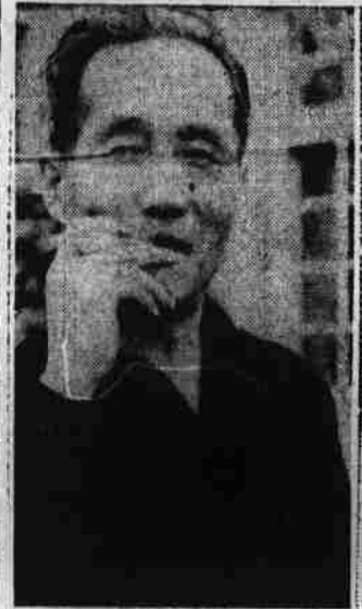
HE'S OUT — Lee Ki Poong, hand-picked by Syngman Rhee for the South Korean vice presidency, was swept out of office in recent riots.

pamphlet issued recently by the U. S. Department of Agriculture also provides a concise summary of services available to woodland owners. It's titled "Public Forestry Assistance For Small Woodlands" (USDA Folder PA-409) and can be obtained from state extension foresters or county agents.