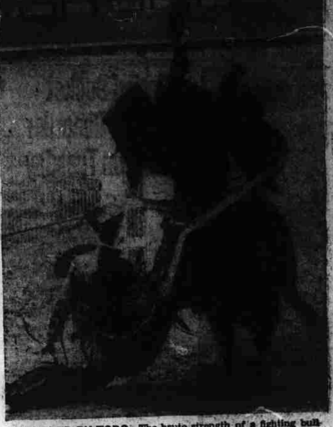
TOPPLED BY TORO —The brute strength of a fighting bull is graphically demonstrated in the Madrid, Spain, ring. Picadors' horses are frequently gored despite padding.