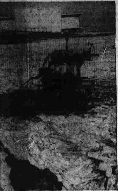
DOG'S BEST FRIEND—After the female German shepherd had been marooned on the Lake Michigan ice for a day, humane officers took to the air. Using a helicopter, they shepherded the shepherd to the Chicago shore, left. But not far from land, the ice gave way. Using a lasso, officer plucked dog from the water, right, and airlifted it to safety.