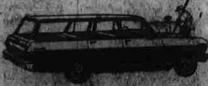
Chevy II 300 Three-Seat Station Wagon

Join in Chevrolet's 50th Anniversary celebration at your dealer's now—By picking up a special order form from your dealer, you can order a "Golden Anniversary Album" LP recording of favorite American songs from Chevrolet for just $1. (For your convenience, many dealers will have the album for sale in their showrooms.)