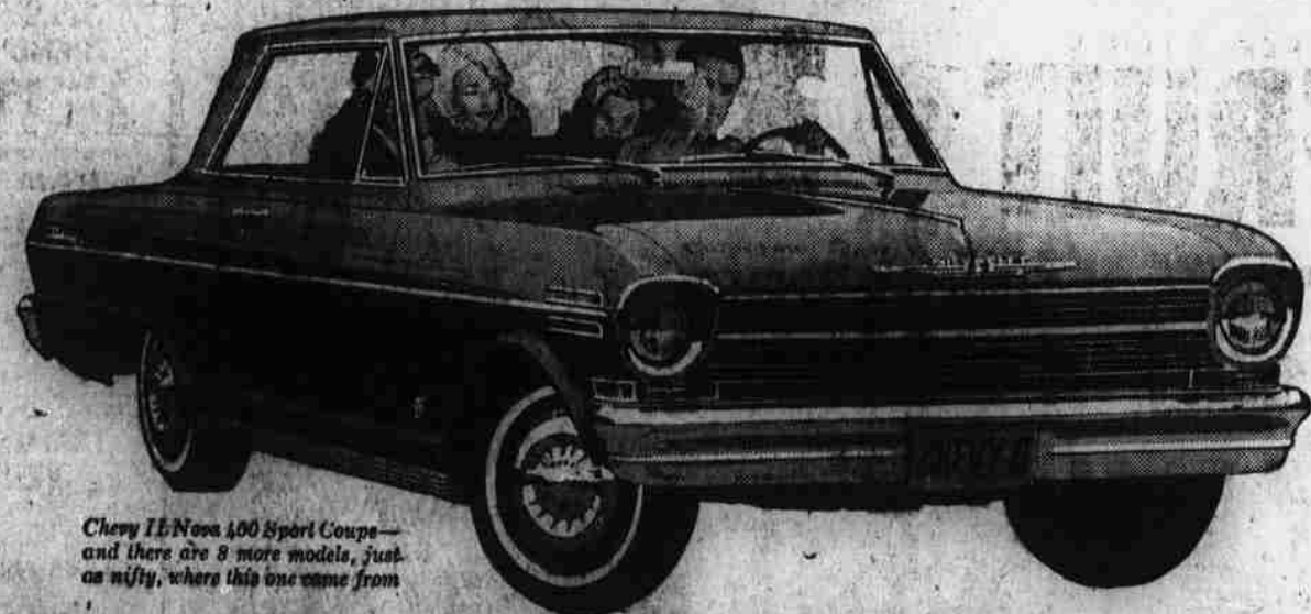
Chevy II Nova 400 Sport Coupe - and there are 8 more models, just as nifty, where this one came from

This one was on the road to success right from the start, a new kind of solid simplicity blended with economy and dependability. Beneath the hood... a frugal 4- or satiny 6-cylinder engine (your choice in most models). Nine new models... sedans, wagons, hardtop and convertible.