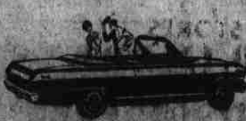
Chevy II Nova 400 Convertible

See the new Chevy II, '62 Chevrolet and '62 Corvair at your Chevrolet dealer's One-Stop Shopping Center